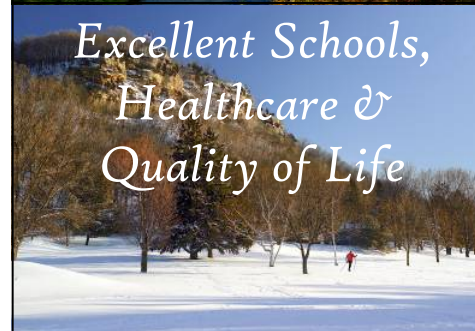
Excellent Schools, Healthcare & Quality of Life