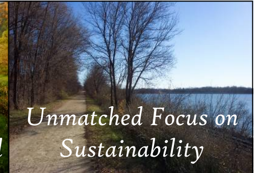
Unmatched Focus on Sustainability