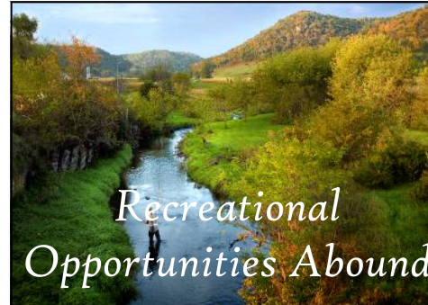
Recreational Opportunities Abound