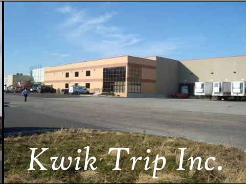
Kwik Trip Inc.