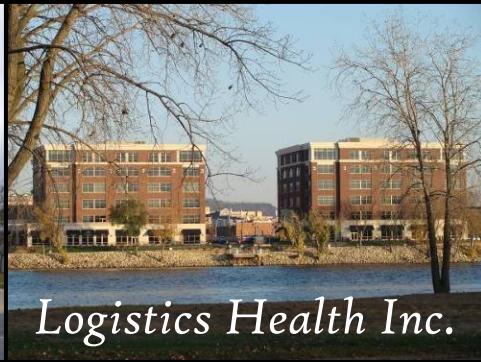
Logistics Health Inc.