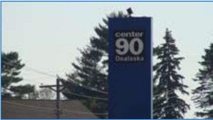
I.C. System will make its permanent home at Center 90 in Onalaska