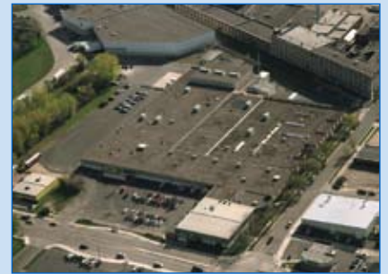
LIPCO's Plant 6, home to I.C. System and La Crosse Footwear