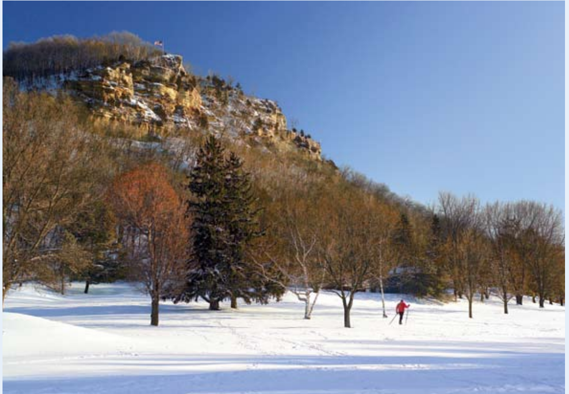
Winter's Wonder drapes the Bluffs creating Unmatched Beauty and a Plethora of Recreation for All

As an integral element of our marketing efforts, LADCO has worked with Robert Hurt Photography to complete LADCO's Iconic Images collection. These photos portray the beauty and quality of life of the La Crosse Area, an integral part of employee attraction and retention strategies today which then allows for successful retention and attraction of employers.