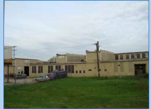
PACAL Industries on La Crosse's near-north side

LIPCO purchased the facilities of PACAL Industries, LLC in 2004 to help the company create a stand-alone Wisconsin based corporation and undertake a large expansion of sales and employment. The State of Wisconsin and City of La Crosse also stepped forward to help accomplish an overall refinancing package. In July 2008, PACAL purchased the facilities back from LIPCO, a full 9 months earlier than called for in the developer agreements. PACAL now has 155 employees compared to 59 employees in 2004 and 95 called for in the developer agreement. The company looks forward to continued growth and expansion in La Crosse.