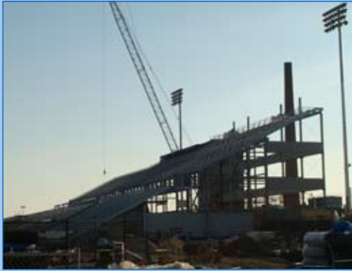
UW-L Veterans Memorial Sports Complex – Phase One of the sports complex will be complete before the 2009 WIAA State Track & Field Meet in June