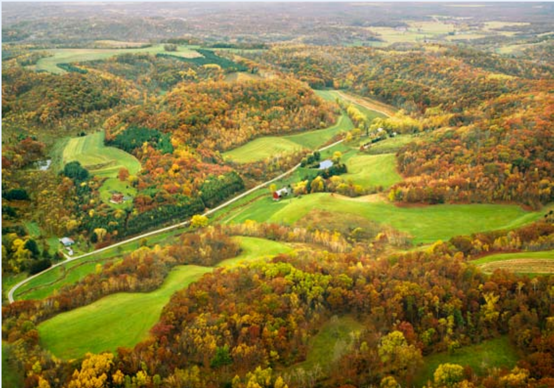
Beauty abounds throughout rural La Crosse County