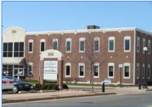
2nd & King Office Building: 500 2nd Street S, La Crosse