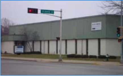
I.C. System is currently operating in LIPCO's Plant 6 Facility on La Crosse's near-north side