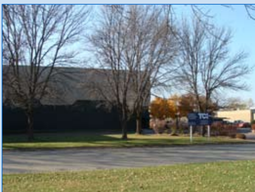
Torrance Casting's addition being completed by TCI