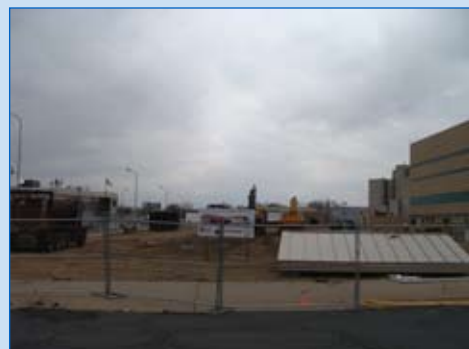
La Crosse County Law Enforcement Center – Construction of the new $29.5 million Law Enforcement Center began recently