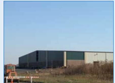
Construction of Amerhart's new facility in West Salem's Lakeview Business Park is currently underway by Wieser Brothers

Construction of Amerhart's new facility in the Lakeview Business Park is currently underway. This 100,000 square foot facility will host almost 40 employees and will allow the company to gain a great deal of efficiency with a larger location and on-site rail service.