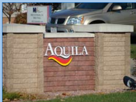
Aquila – Aquila Corporation, manufacturers of a full-line of seat cushion systems designed for pressure sore prevention and healing, has expanded into its new facility in the Holmen Business Park