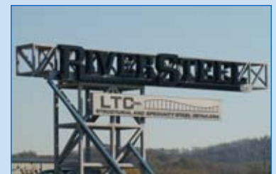
Congratulations to River Steel and La Crosse Sign Co. on being awarded the 2008 Best of Show Award from the Wisconsin Sign Association