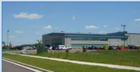
River Steel took occupancy of its new facility in early 2008

LADCO was instrumental in launching the Lakeview Business Park in 2003 along with the Village of West Salem, La Crosse County, and the Lakeview Partners (Xcel Energy & CenturyTel), nearly 20 years after this portion of the La Crosse County farm was designated as a highly desirable site for rail-served industrial land. Total investment in the park to date exceeds $11 million. The Lakeview Business Park features a total of 160 acres with access to the Canadian Pacific Railroad, visibility and easy access to Interstate 90.