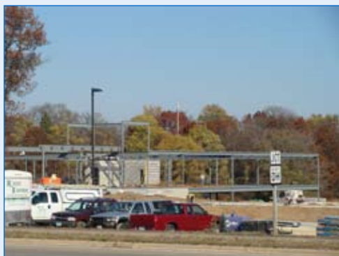
Franciscan Skemp & Altra Federal Credit Union - Franciscan Skemp recently broke ground on its new 20,000 square feet facility at Hale Road & Holmen Drive, Holmen. Altra Federal Credit Union is building a 5,000-square foot facility south of the clinic