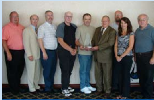
PACAL Industries Management and Staff celebrate the Diamond Recognition Award

work, and play. The Diamond Recognition Award , recognizing leadership, quality, innovation, expansion, and job creation, was presented to PACAL Industries LLC. Supporting the spirit of partnership, the Triangle of Achievement Award was conferred upon those parties involved in bringing the new Veterans Memorial Sports Complex to fruition on the UW-La Crosse Campus: the UW-La Crosse Foundation, the La Crosse Area Veterans, and the Community Banking Coalition (Associated Bank, Coulee Bank, Merchants Bank, M&I Bank, State Bank Financial, U.S. Bank, Wells Fargo). Winners of the LADCO/CenturyTel Coulee Region Entrepreneurial Initiative Business Plan Competition include: Simply Entrée (Holmen), eContractorBids.com (Onalaska), Absolutely Edible (La Crosse), and Firefly Baking Company (La Crosse).