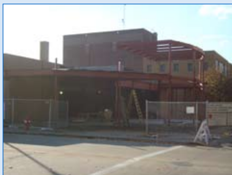
Western Technical College – The Lunda Center, a community and conference training center, will allow WTC to increase training for incumbent workers and expand the emphasis on upgrading the education levels of the adult population in the region