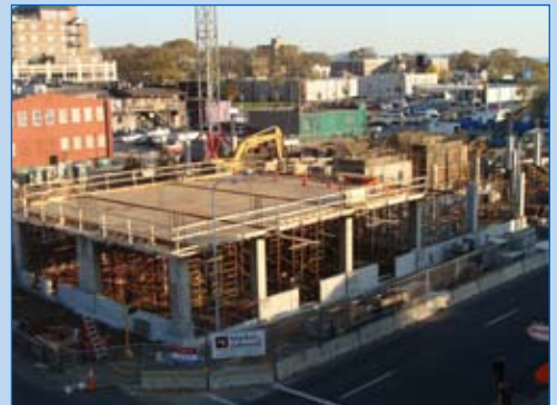
Grand River Station – City officials broke ground in July on the new transit center at 3rd & Jay Street in Downtown La Crosse. The project is being completed by Market & Johnson