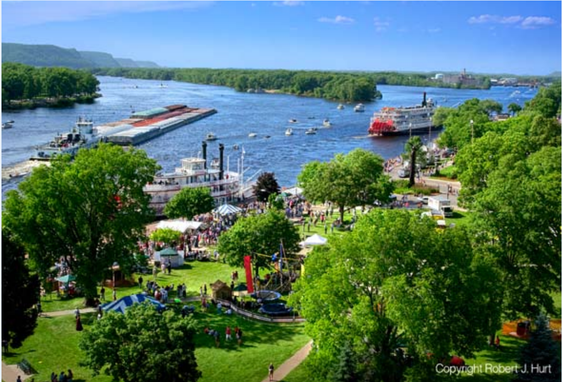
Recreation and Commerce come together in La Crosse – The Grand Excursion 2005